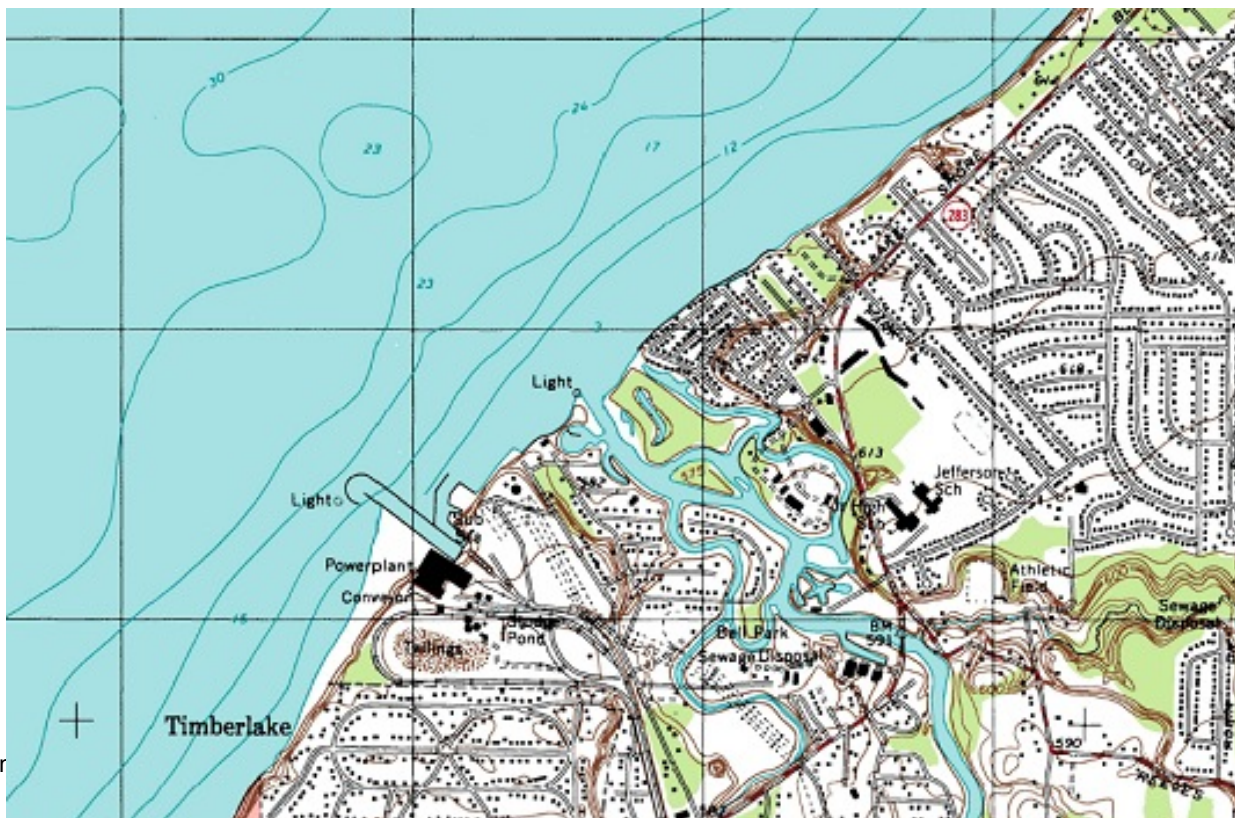
Topographic map of Eastlake, Ohio