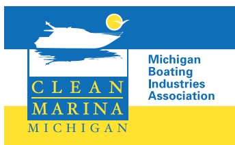
FLAG (MBIA MEMBER OR STANDARD) 35" x 55"