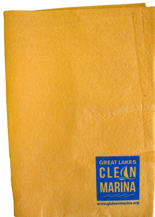
CHAMOIS / TOWEL 12" x 17"