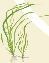
Valisneria americana (Wild Celery)

Macrophytes, phytoplankton and zooplankton (microscopic plants and animals) and detritus.