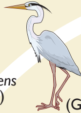
Ardea herodias (Great Blue Heron)