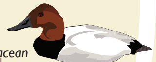
Aythya valisineria (Canvasback)