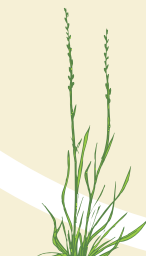
Macrophyte (Aquatic Plant)