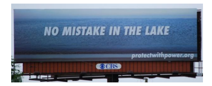
Figure 5: The Lake Michigan POWER Coalition opposes offshore wind energy development in areas of West Michigan.

The recent "No Mistake in the Lake" billboard campaign features an image of an uncluttered, seemingly infinite horizon on Lake Michigan (Figure 5). This suggests that the visual amenity of an undisrupted horizon is important to the coalition, consistent with the landscape cultural model. The group members have an attachment to the shoreline and derive some of their identity from being part of lakeshore communities. This kind of place attachment and place identity is consistent with Devine-Wright's concepts. Both the cultural models and the place attachment ideas give a much richer picture of offshore wind acceptance than a simplistic NIMBY description. It is also true that wind farm supporters have an attachment to the shoreline, but they emphasize different values and uses.