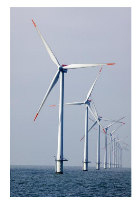
Figure 1. Wind turbines at the Horns Rev wind farm, Denmark.

Locating turbines offshore rather than on land offers several important benefits, as well as some significant drawbacks. A recent planning document of the U.S. Offshore Wind Collaborative stated that America's offshore wind resource is vast and plentiful [1]. Winds tend to blow harder and more consistently offshore than over land, which could produce a steadier supply of electricity. The sporadic nature of onshore wind energy production creates some challenges for our current electrical grid system. In addition, offshore turbines could be established close to cities along the Atlantic and Great Lakes coasts, reducing power transmission issues. Offshore turbines can be larger and rotate faster than land-based models, in part because turbine noise is much less likely to disturb