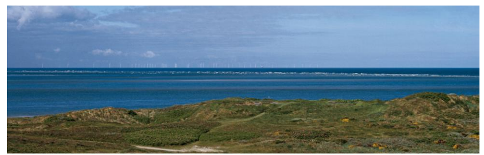
Figure 3. The view of Horns Rev wind farm from the nearest shoreline, 8 miles away.

In these two coastal areas of Denmark, surveys indicate that people are more supportive of additional wind development offshore than onshore [9]. People across Denmark felt similarly – 25 percent of respondents opposed new onshore developments and only 5 percent opposed new offshore wind farms [11]. However, people who use Denmark's beaches frequently and who live near Nysted, the closer of the two wind farms, were more likely to oppose offshore wind [12,13].