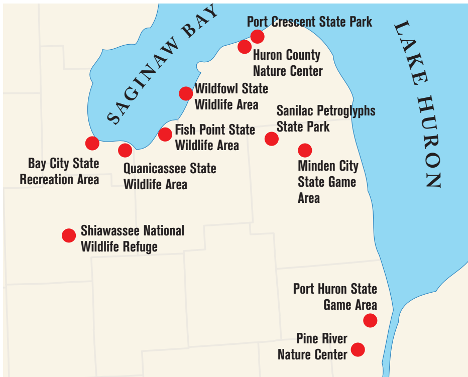
Map of a few of the great wildlife viewing areas in the Thumb.