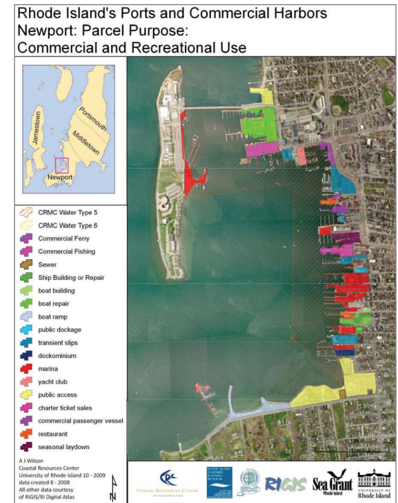
Rhode Island Sea Grant