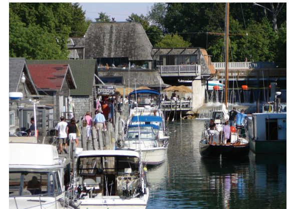
Michigan Sea Grant