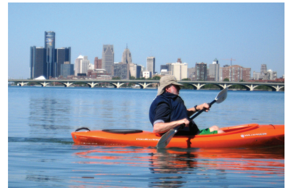
Detroit Yacht Club